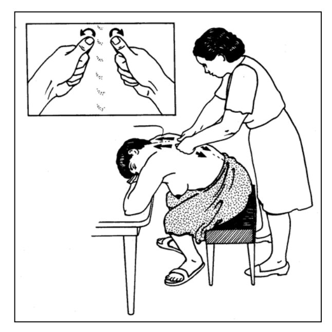
Figure 1. Helping mothers relax before expressing breastmilk

From: WHO, UNICEF, UNAIDS. Infant and Young Child Feeding Counselling: An Integrated Course. WHO: Geneva; 2006.