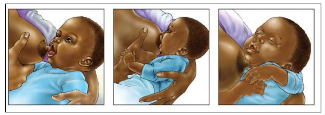
From: Ministry of Health and Social Welfare [Kingdom of Lesotho]. Infant Feeding Counseling Cards. Maseru; 2008.

Good attachment helps both mother and baby. Good attachment helps to ensure that the baby suckles well and helps the mother produce a good supply of breastmilk. Good attachment helps to prevent sore and cracked nipples. Breastfeeding should not be painful.